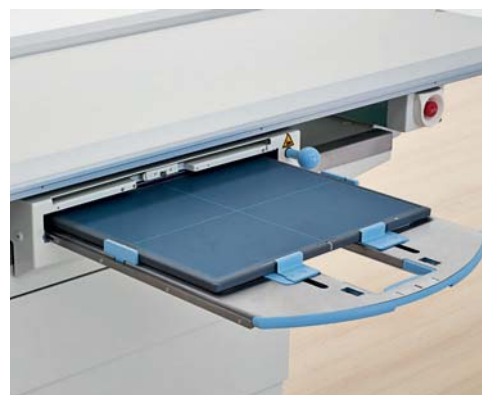
The cassette holder is designed for single handed operation