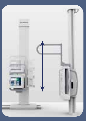
SID track to table