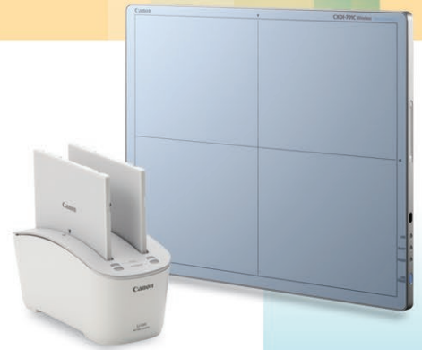
CXDI-701C Wireless System shown with optional battery charger.*