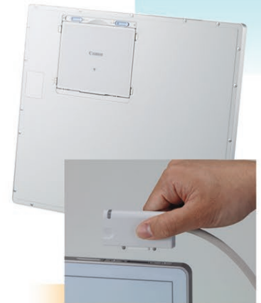
With the wired option,* the CXDI-701C Wireless System can charge the battery in the detector.